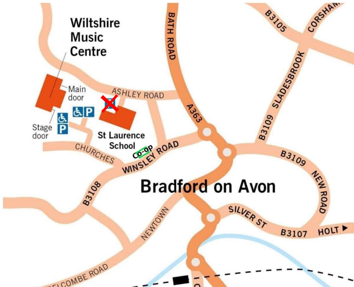
The turning from Churches